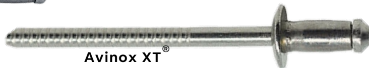
Avinox XT ®