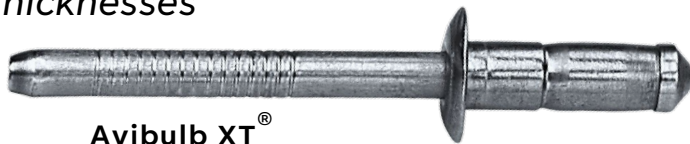
Avibulb XT ®

Avibulb ® XT (steel) and Avinox ® XT (stainless steel) fasteners are high performance structural breakstem fasteners with excellent bulbing tail formation, ideal for thin sheet materials. The new fasteners feature a wide grip range, especially suited for applications with varying sheet thicknesses